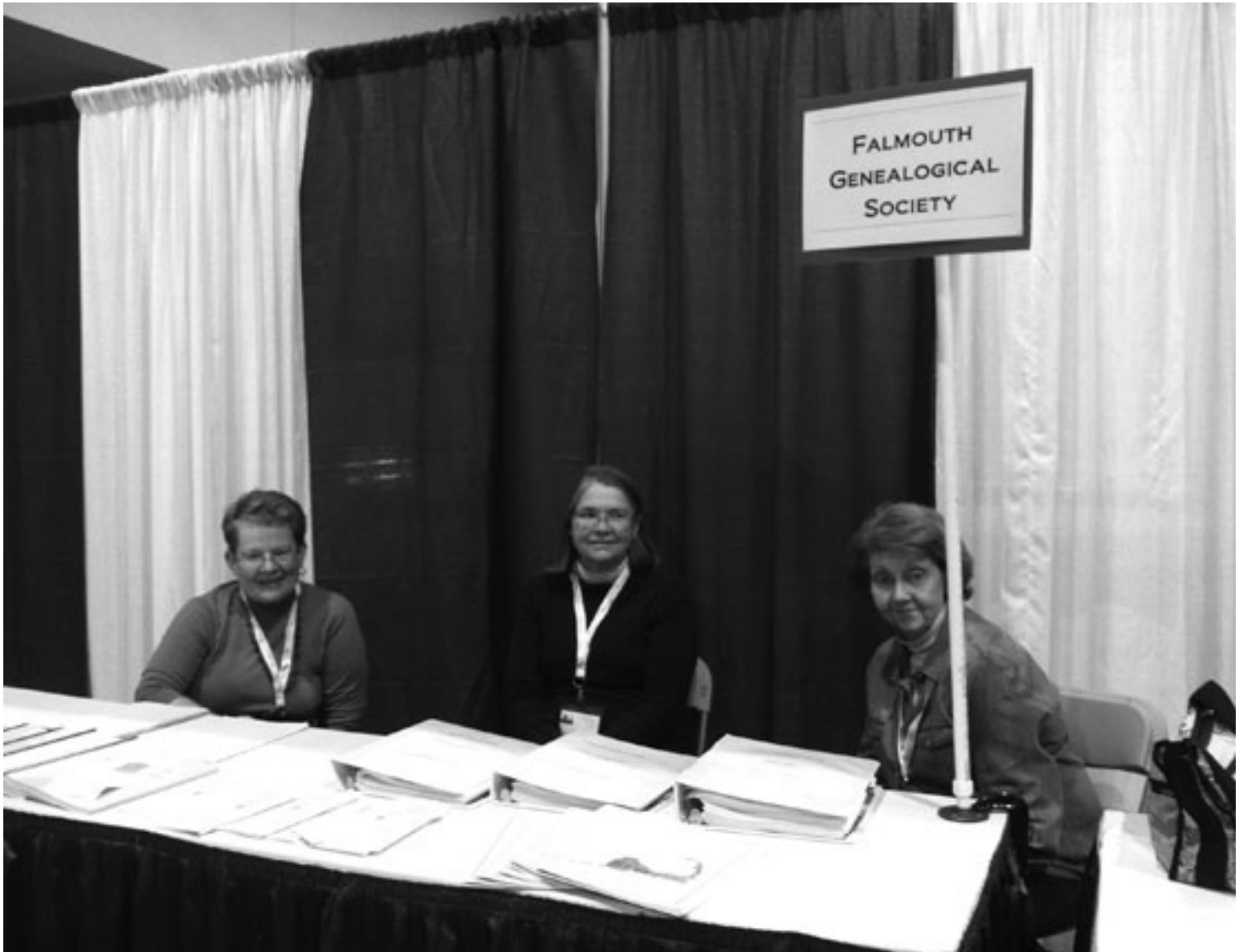
Members of Falmouth Genealogical Society man the hospitality table at NERGC