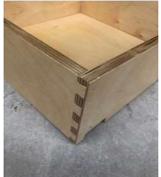
Dovetail Drawer $75 Each