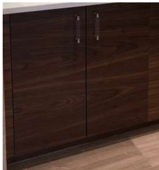
Grain Matched Slab $ depends on wood