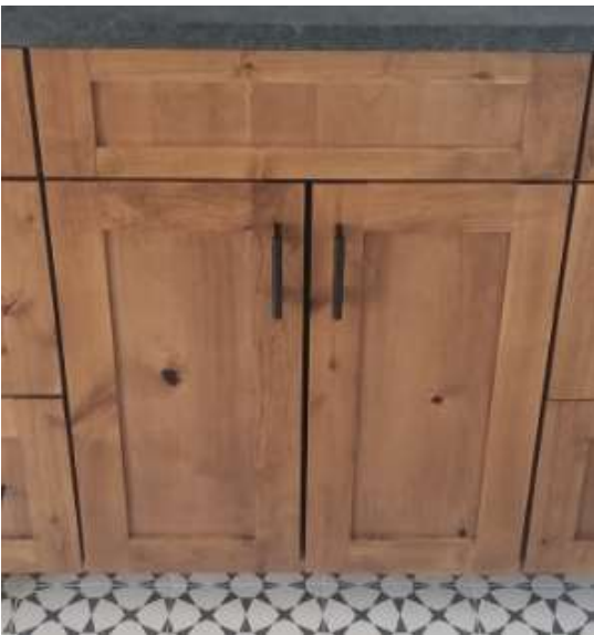
Stain Grade Shaker $30 sq/ft