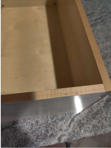
Standard Drawer $30 each