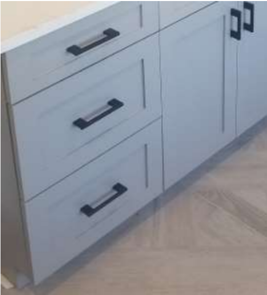
Paint Grade Shaker Style $10 sq/ft

We offer stain grade and paint grade options. Our paint grade doors are constructed out of a CNC milled solid piece of HDF which eliminates all seams and provides a very smooth finish at an affordable cost. Stain grade shaker & slab doors are milled in house. Mitered and Raised panel doors are ordered from TaylorCraft doors in Taylor, TX. TaylorCraft options: https://taylorcraftdoor.com/