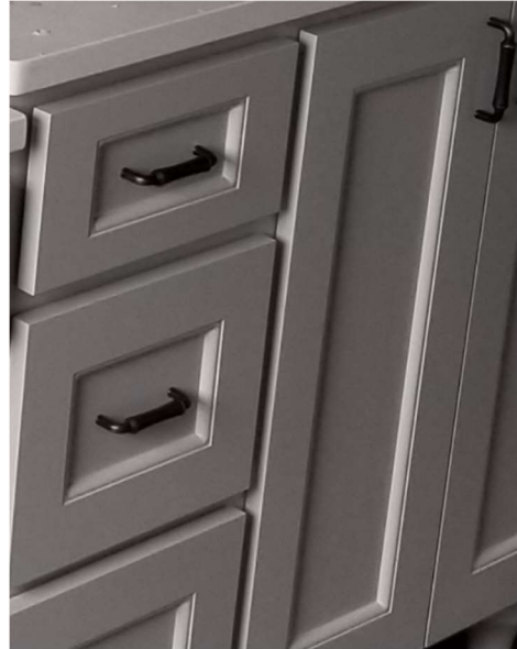
Paint Grade Beaded Shaker $12 sq/ft