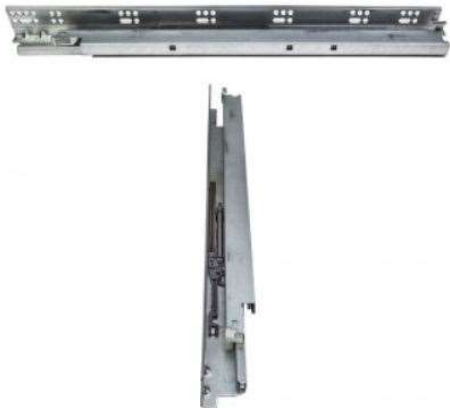
Soft Close Undermount $25 each