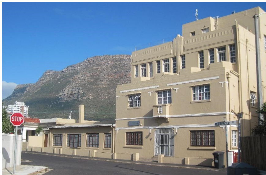
The U. of N. campus has multiple sites, and Peggy and I stayed in the guest quarters here but walked to the building where I lectured (about 10 minutes).

It was winter in South Africa, so we were glad we took sweaters and a jacket. Here, my lectures were on the Israelite kings from Solomon to the Babylonian exile (first week) and the 8 th century prophets (second week) with their deep reflections and sermons on social justice, a theme that