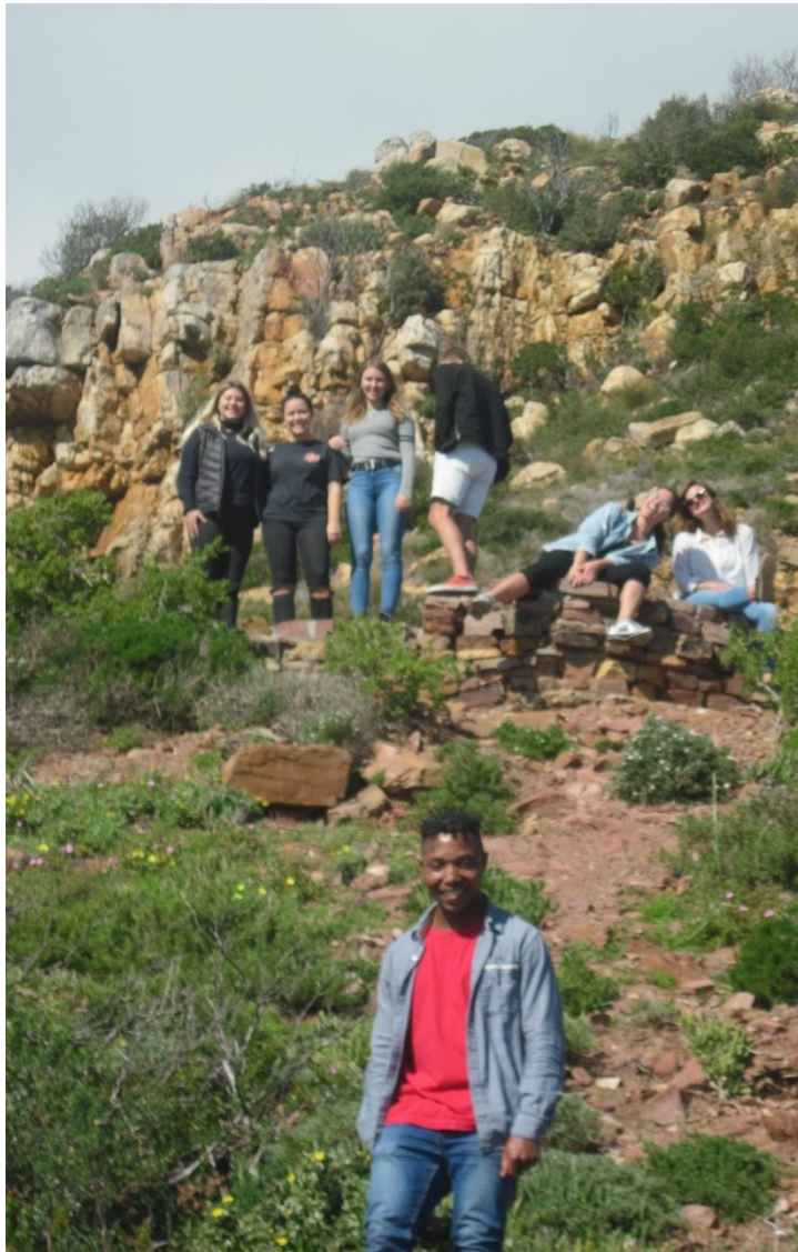
Here are some of the students in the South African school on an outing on Saturday, where we visited the penguin reserve and drove over Chapman's Peak (the site of the famous bicycle race).

most extraordinary sign of the power of the Christian gospel in the world in my lifetime,” which is no small thing!