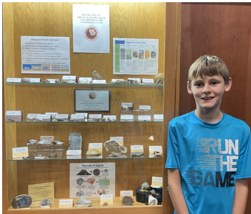
Ahziah REACH Display