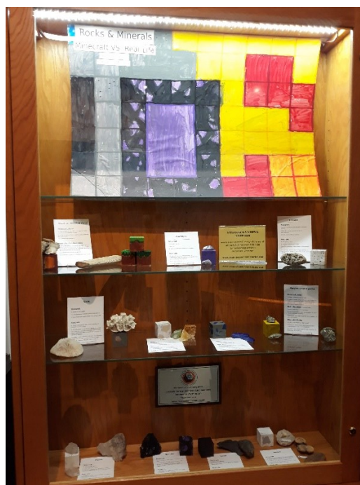
Jr Minecraft Display