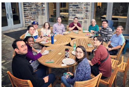
Sunday Evening Fellowship Dinner

For over 80 years, Duke Lutherans has walked with students and young adults through the joys and challenges of campus life and young adulthood.