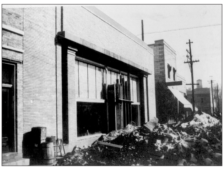
Above, 1916 when the building was under construction; Below, the interior of the building today showing the balcony.