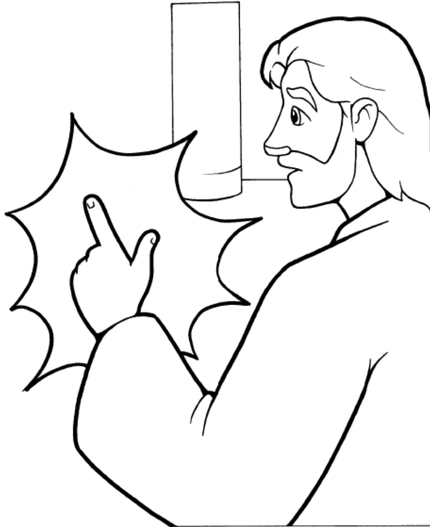
Jesus Appears to the Disciples