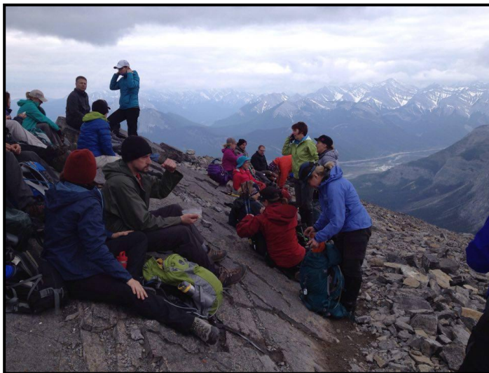
The group stops for lunch at the summit and a much deserved break