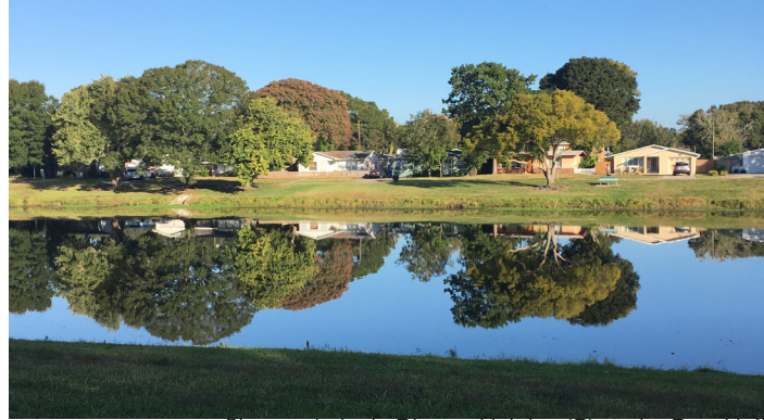
Sirmons Lake in Disston Heights