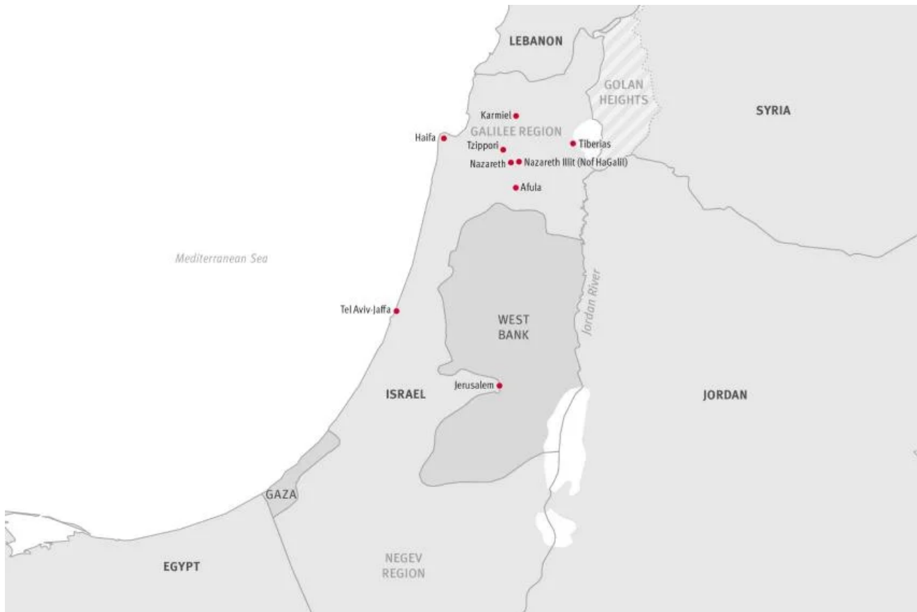
Israel and the Israeli-occupied Palestinian Territory, made up of the West Bank, including East Jerusalem, and the Gaza Strip, as well as the Israeli-occupied Golan Heights

For the past 54 years, Israeli authorities have facilitated the transfer of Jewish Israelis to the OPT and granted them a superior status under the law as compared to Palestinians living in the same territory when it comes to civil rights, access to land, and freedom to move, build, and confer residency rights to close relatives. While Palestinians have a limited degree of self-rule in parts of the OPT, Israel retains primary control over borders, airspace, the movement of people and goods, security, and the registry of the entire population, which in turn dictates such matters as legal status and eligibility to receive identity cards.