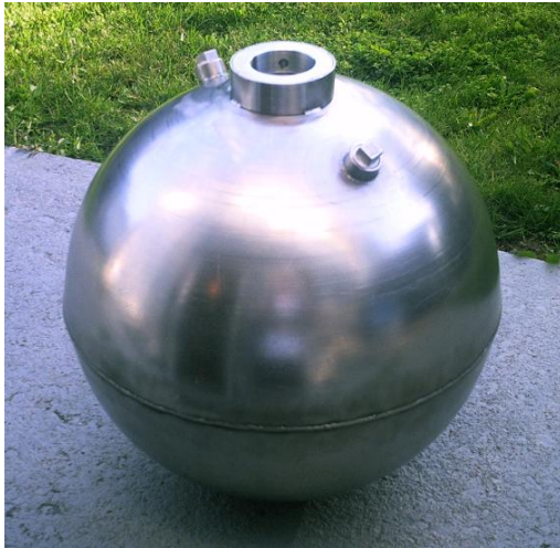
15" Interface Float with fill ports

The Liquor and Soap interface is detected by a transmitter consisting of a flexible stainless sensor hose. The hose is flange mounted at the top and has a weighted anchor suspended at the opposite end. Traveling up and down the flexible sensor hose is a specially designed float that follows at the soap/liquor interface. As the float position changes along the flexible sensor hose it closes very small reed contacts within its magnetic field through the wall of the flexible sensor hose. The closed reed switches provide an uninterrupted measurement voltage from a resistance chain (a potential divider) to the transmitter and this voltage is proportional to the liquid interface level. This variable voltage is then converted into a standard 4-20mA analog level signal. The most important piece of equipment is the specially engineered 15" diameter large interface float which has the ability to be adjusted to provide the needed buoyancy, based on calculations and the customer's process data. A correctly adjusted buoyancy allows the interface float to maintain its position at the liquor and soap interface with ease.