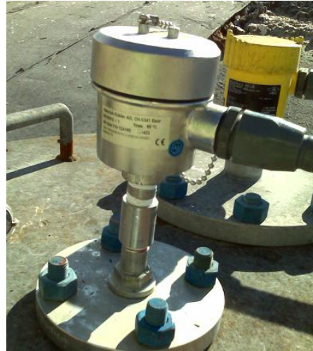
Interface Transmitter Head