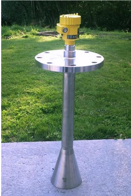
Flanged Microwave Level Transmitter

The soap surface level is detected by using a microwave radar gauge. Extremely short microwave pulses at low power levels are emitted by the antenna system to the measured product, reflected from the product surface and received again by the antenna system. The pulses travel with the velocity of light and the time from emission to reception of the signals is proportional to the level in the vessel. From this a soap surface level can be measured with a 4-20mA analog level signal. The advantages of using a microwave radar gauge is that it is not affected by temperature, condensation build-up, process composition changes and pressure changes. Any false echo's within the tank can be mapped out with the software as seen below. The low frequency radar also has the ability to measure the top surface of soap with very low density or air entrained.