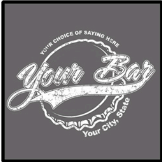
Design name: BOTTLECAP