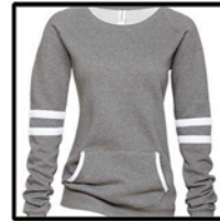
Style Number: EZ370