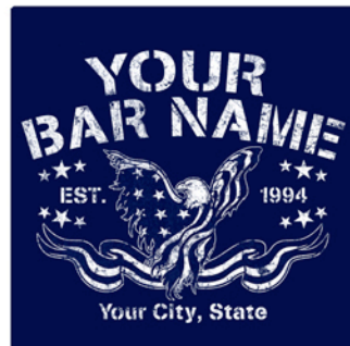
Design name: AMERICAN EAGLE