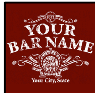
Design name: BEER KEG