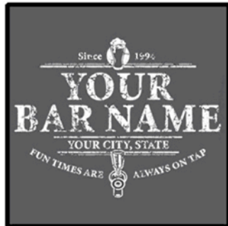
Design name: FUN ON TAP