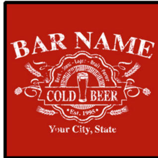
Design name: COLD BEER