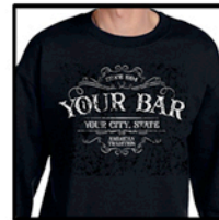
Style Number: BR180

S, M, L, XL $24.00 XXL $26.00 XXXL $27.00