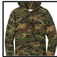
Style Number: PC78HC

S, M, L, XL $24.00 XXL $26.00 XXXL $27.00 XXXXL $28.00