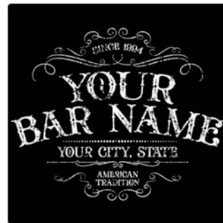
Design name: WHISKEY LABEL