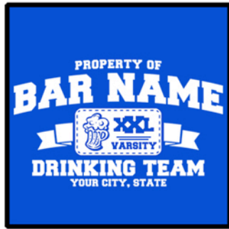
Design name: DRINKING TEAM