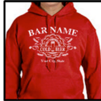
Style Number: BR185