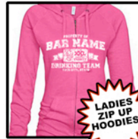
Style Number: EZ092

S, M, L, XL $15.00 XXL $17.00 XXXL $18.00 XXXXL $19.00 XXXXXL $20.00