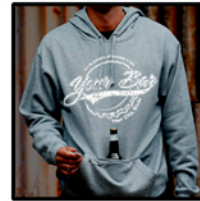
Style Number: BR8815

S, M, L, XL $18.00 XXL $20.00 XXXL $21.00 XXXXL $22.00 XXXXXL $23.00