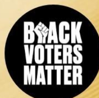
Black Voters Matter