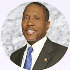
State Senator Darryl Rouson