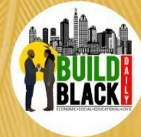
Build Black Daily