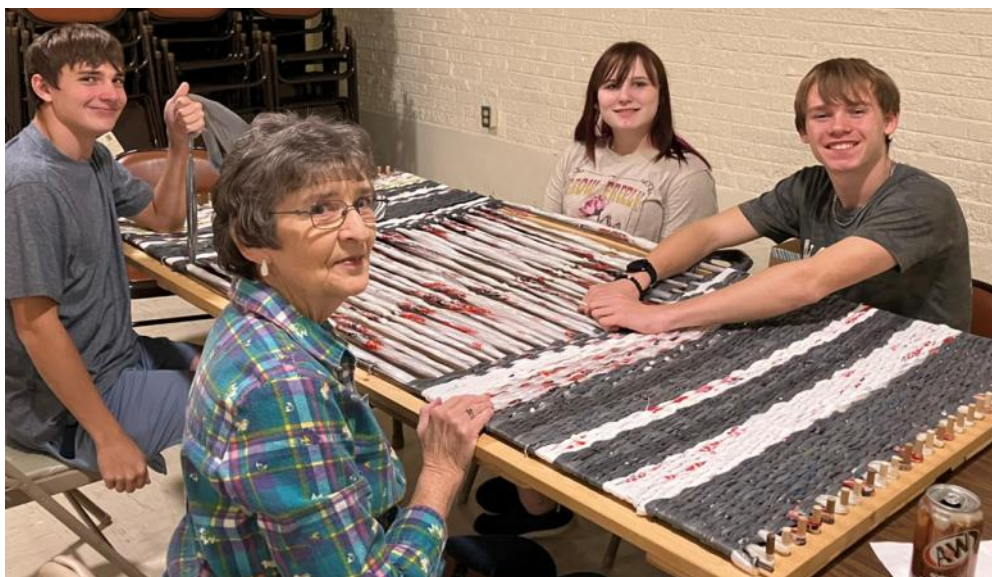
Forge members helping with mat weaving.

Last month, AUMC Youth helped pack 20 shoeboxes for Operation Christmas Child. That was enough to push our church up to a total of 111 shoeboxes which will soon make their way around the world in time to give some Christmas cheer to a boy or girl in need.