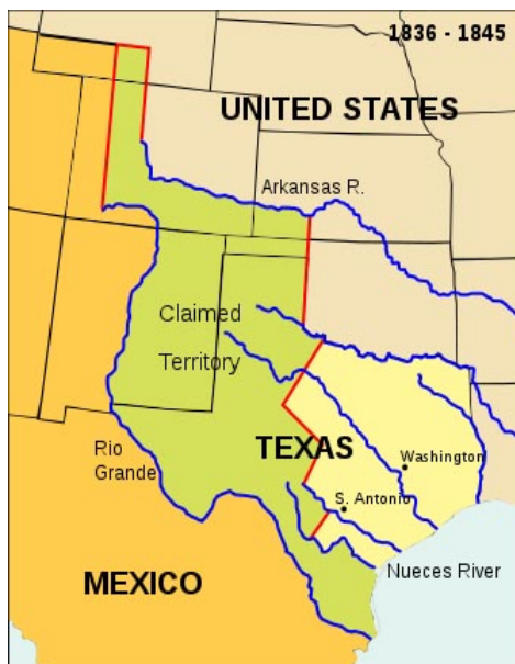
Map of Texas Proper vs. The Claimed Territory

The debate over annexation is taken up by the 28 th Congress in its lame duck session, which opens in December 1844, with Tyler still in the White House and Calhoun as Secretary of State.