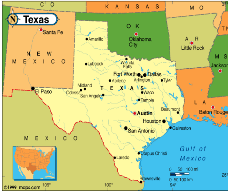
Map Of The Eventual State Of Texas Bordered By The Rio Grande River

At this point, Polk is frustrated by the lack of decisive action in the Senate. A possible solution comes from his soon-to-be Treasury Secretary, Senator Robert Walker of Mississippi, who proposes a combination of Brown’s plan to immediately annex existing Texas (“narrow borders”) along with Benton’s plan to delay closure on the broader “claimed lands” until later.