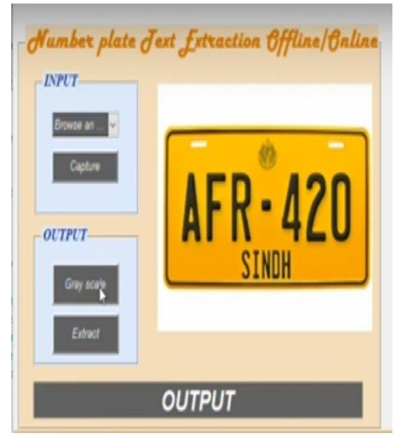
Figure, 3. (Interface after select an image.)

Figure 2, shows the basic interface of our project. After that simply click on select image and click on browse and open the image in interface. We also use live cam option to take any image. Figure 3, shows the interface after selecting an image.