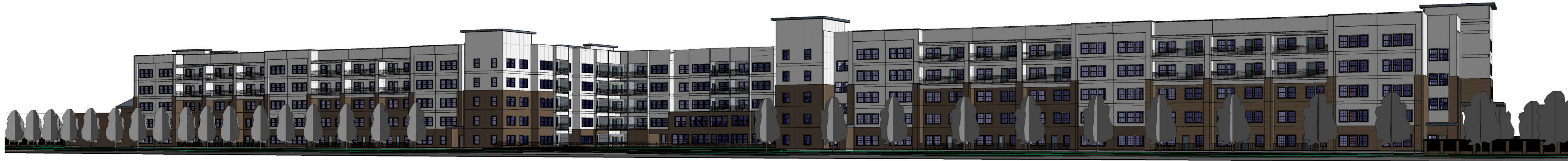
2 VIEW FROM ACROSS THE STREET RETAIL