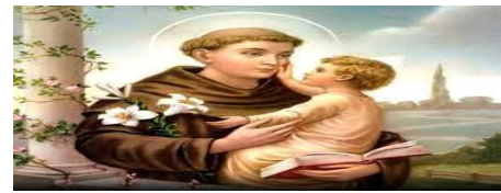
St. Anthony ~ Browns Valley