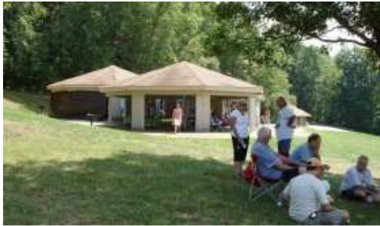
Part of the Pavilion