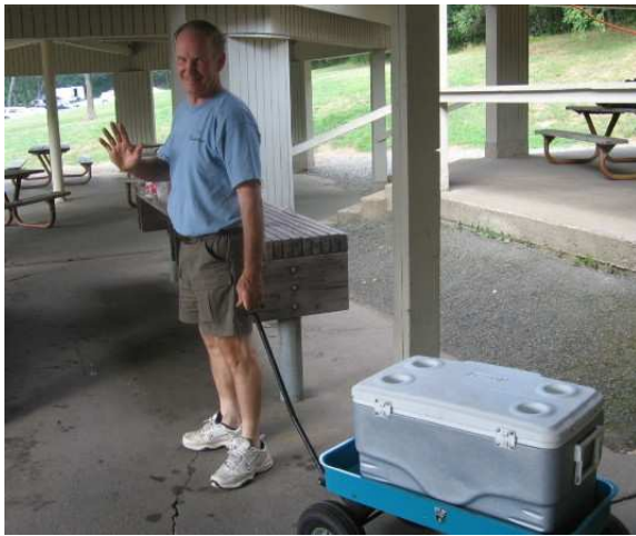
Just one of those little wagon days