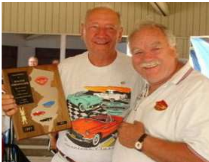
Outstanding Driving Award (12,000 miles)