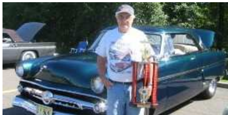
Best Ford at the show