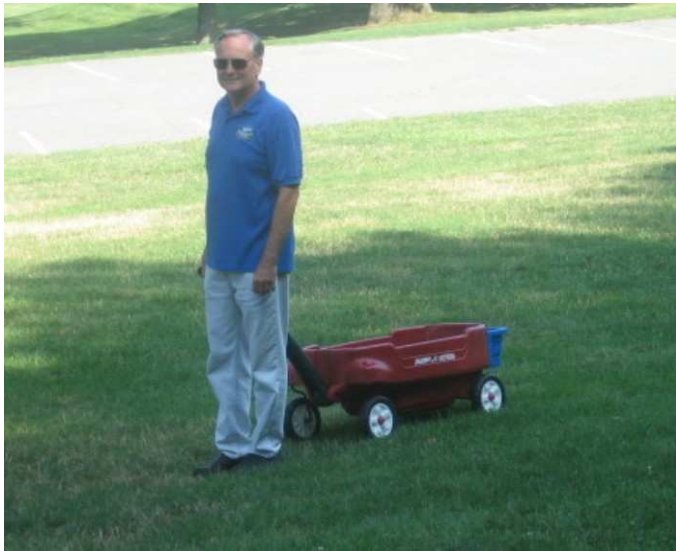
His little red wagon