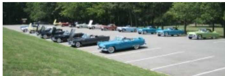
A little fuzzy, but all of them