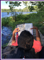
Enjoy an afternoon by the pond

Camping: A limited number of campsites are available on the campground. For those interested in more information please call or email housing@campetna.com