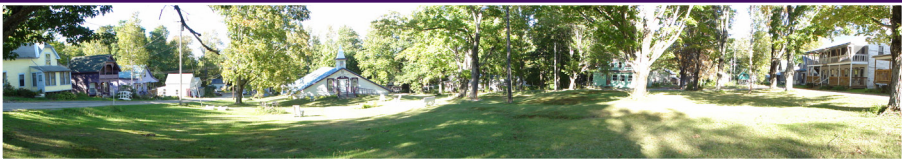
Camp Etna's Common Green

People from all spiritual disciplines are invited to participate in the programs, classes in the and workshops.