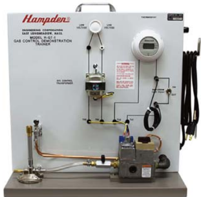
Model H-GT-1 Gas Control Demonstrator Trainer

The Hampden Model H-GT-1 Gas Control Demonstrator Trainer provides students with experience in: