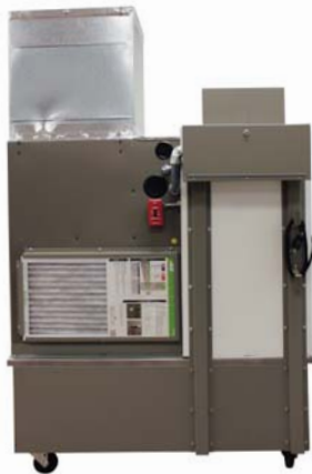
rear view ▲