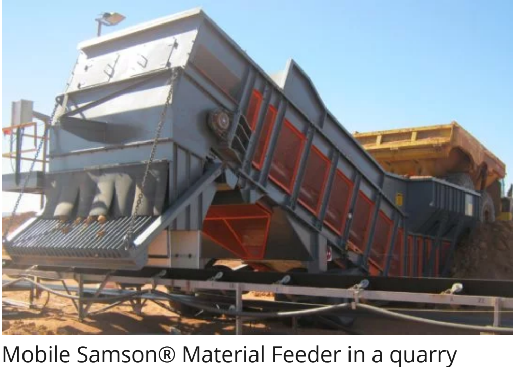
Mobile Samson® Material Feeder in a quarry