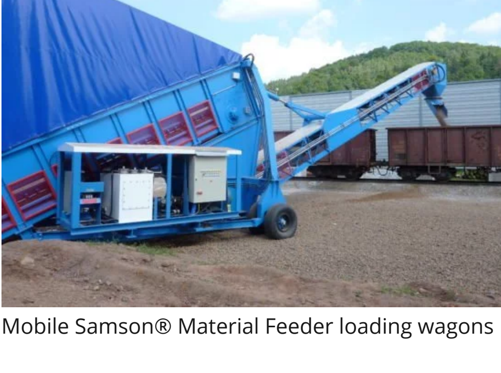
Mobile Samson® Material Feeder loading wagons