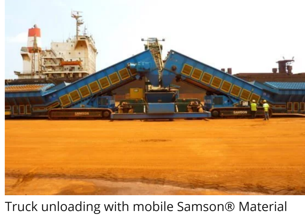
Truck unloading with mobile Samson® Material Feeders