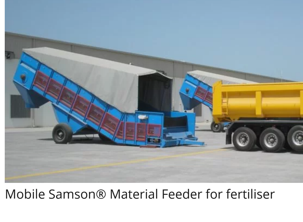
Mobile Samson® Material Feeder for fertiliser