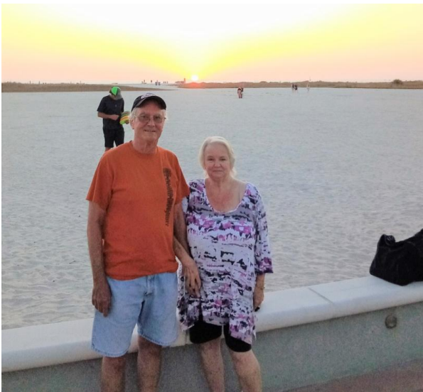
Guess who - trying to make us jealous

5/6-8 Rhinebeck NY, Dutchess CTY Fairgrounds