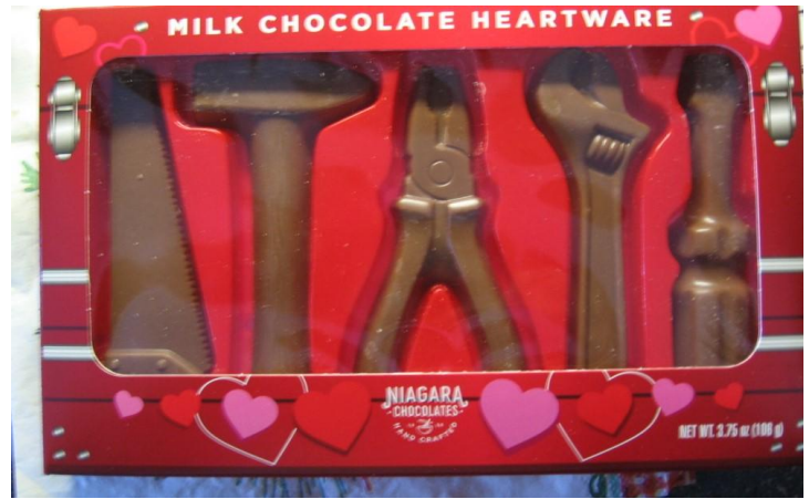
I got tools for Valentines Day

If my body was a car, I would be trading it in for a newer model. I've got bumps, dents, scratches & my headlights are out of focus. My gearbox is seizing up & it takes me hours to reach maximum speed. I overheat for no reason and every time I sneeze, cough or laugh either my radiator leaks or my exhaust backfires!