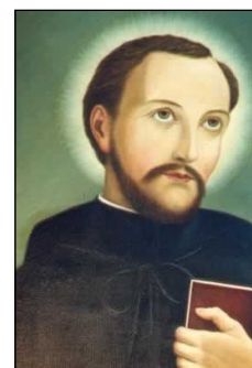
Feast Day: October 19

Sources: britannica.com and ignatianspirituality.com