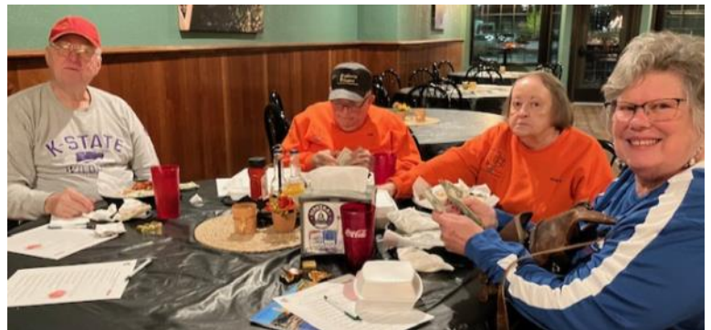
November H-2 Gathering