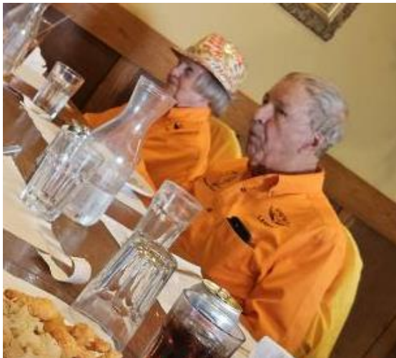
Ride to Breitbachs in Balltown