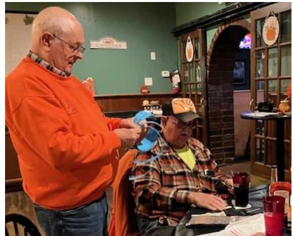
November H-2 Gathering