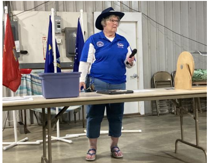
Iowa District Rally