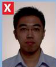
光度不足 Too dark