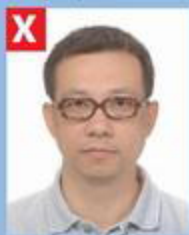
眼鏡遮擋眼睛 Frame across eyes