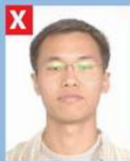
面 / 眼鏡反光 Flash reflection on face/glasses