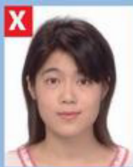
頭髮遮擋眼睛 Hair across eyes