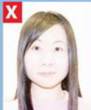
過度曝光 Too light