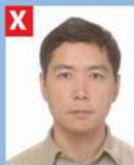
不置中 Not centred