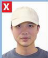
佩帶頭飾 Head coverings