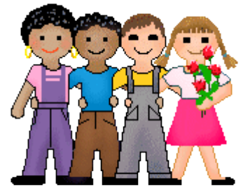
Martin Luther King, Jr. Day

We ended the quarter celebrating the children who have come to school everyday. They were awarded the Perfect Attendance Awards at our award ceremony.