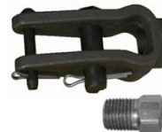
Bendix ASA Replacement