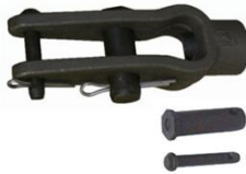
Arvin Meritor ASA Replacement