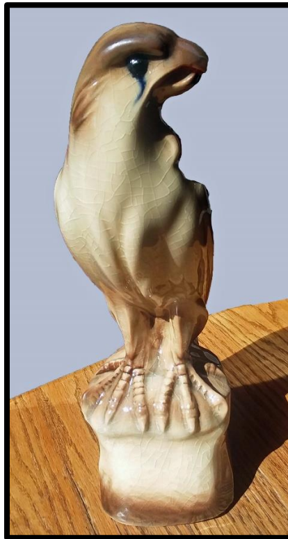
Applied tan and white glaze decoration with cobalt tears from each eye.