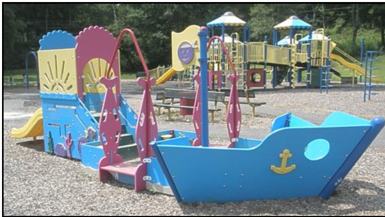
Playground fit for all ages...

Village Board—3rd Monday of the month at 7 PM Planning Board—2nd Wednesday of the month at 7 PM Zoning Board of Appeals—Meets as needed