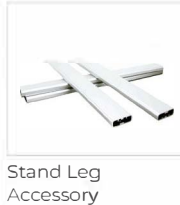
Stand Leg Accessory