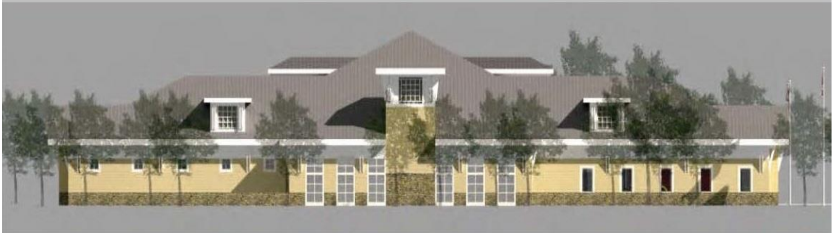
Side Elevation (Mason Street)