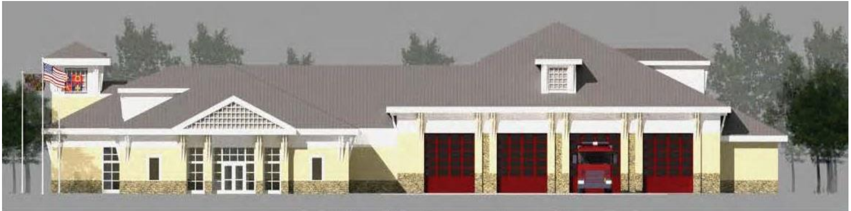
Front Elevation (Georgia Avenue)