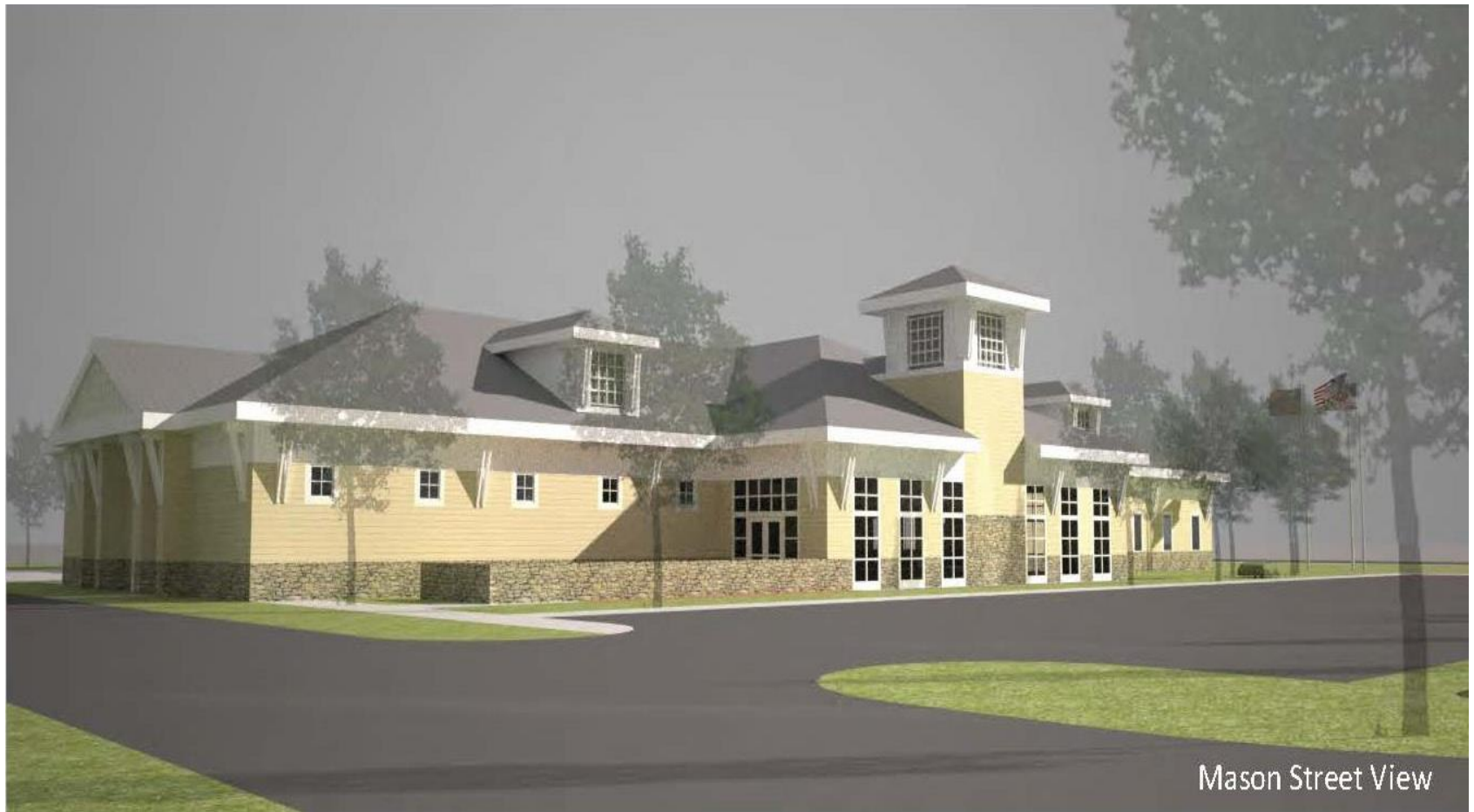
Mason Street View