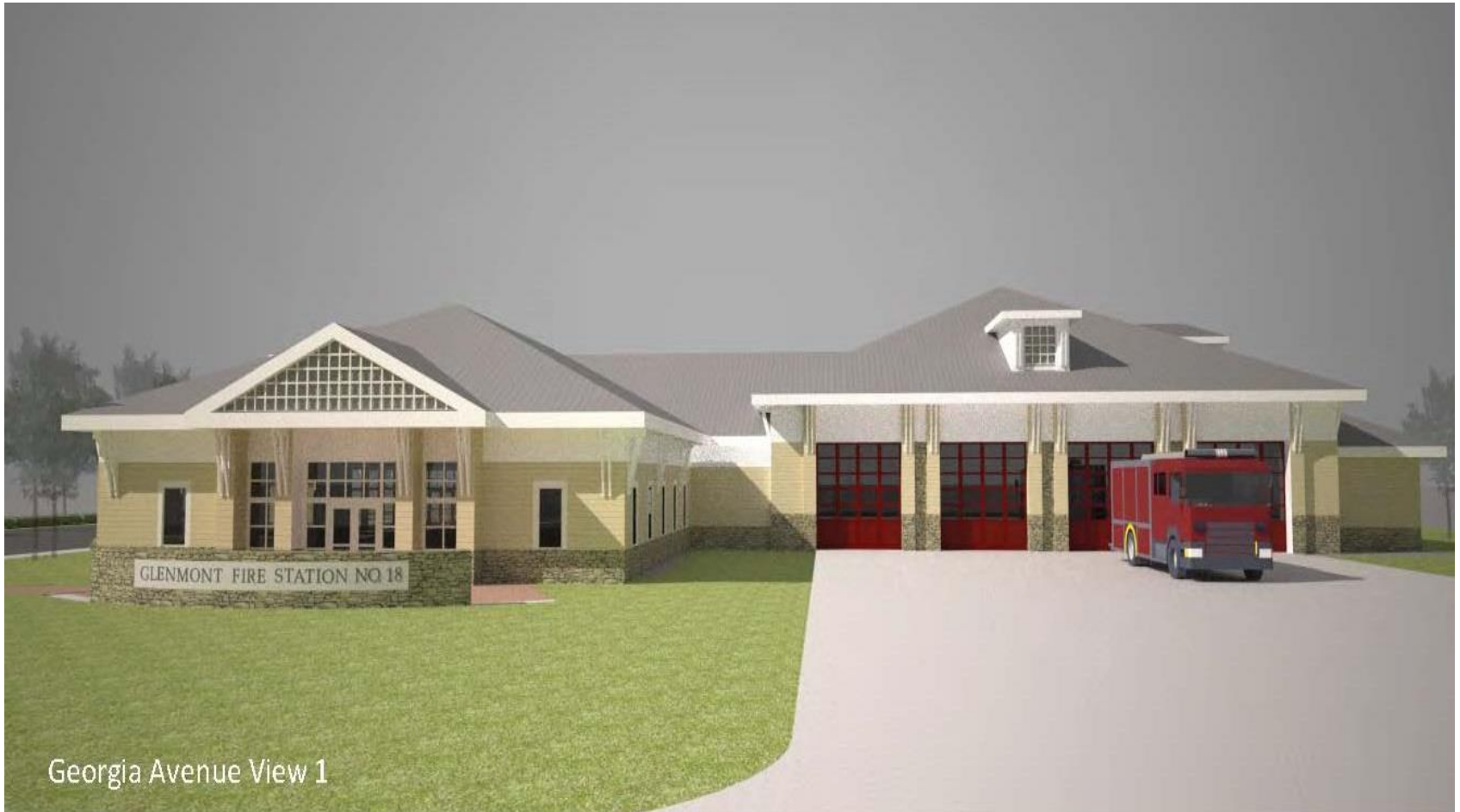
Georgia Avenue View 1