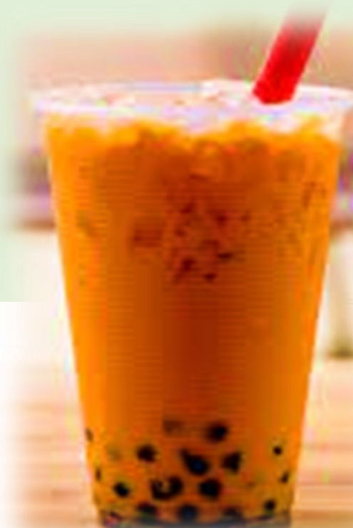
Thai Tea (contains dairy)