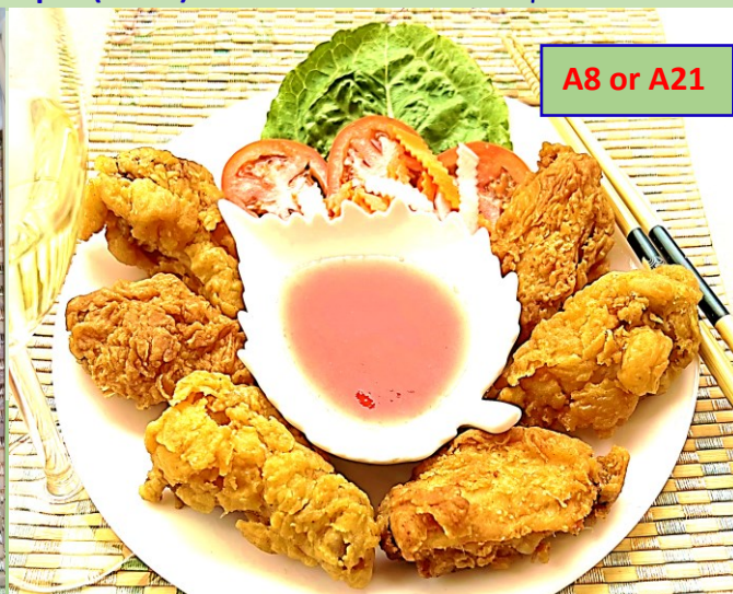
A8 or A21