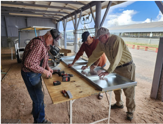
Cornville School library bookshelf modifications provided by our members.