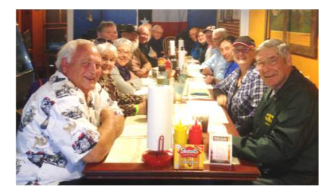
OTC Members enjoying lunch at Lonestar BBQ

Our May meeting was at the Evergreen Air Museum. The weather was inhospitable (to say the least). We had a large showing of members, but with the deluge of rain, everyone arrived in automobiles. It was either take the car, or sign up for a place on the ark. Several members braved the rain to scout out the grounds for the upcoming rally. Our meeting was held at a large table off to the side of the museum's restaurant and gift shop. When the meeting adjourned, members made their way to Lonestar BBQ in Dayton. Lonestar is catering one of the dinners for our July rally. The staff were friendly and efficient, as usual. The BBQ owners came by to suitably and good-naturedly harass us. One OTC member had a rack of ribs and used their knife and fork to eat them. This became a question of etiquette - "pick them up with your hands and dig in" was the consensus directive. The meal was very enjoyable and the portions overly-ample. Many of us waddled out with a doggie bag, but I doubt if Fido saw any Lonestar leftovers.