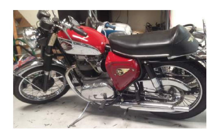
1967 BSA A65