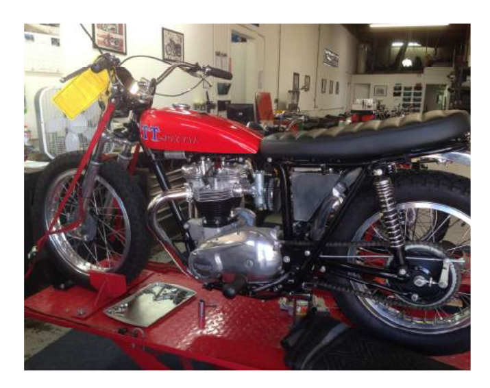
1969 TCM Triumph TT Special