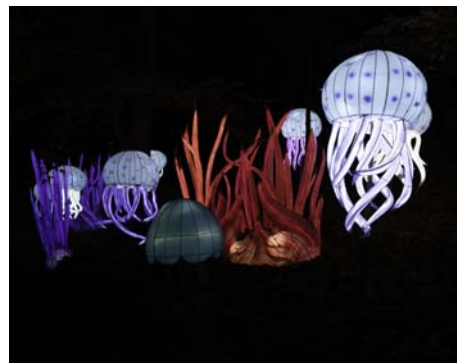
Wild Illuminations at the Pittsburgh Zoo & Aquarium.

The Pittsburgh Zoo and Aquarium are celebrating the season with Wild Illuminations: A Holiday Lantern Experience throughout December from 5:30 - 10 p.m. This magical winter wonderland includes silk lanterns and a million twinkling lights. Info at pittsburghzoo.org .