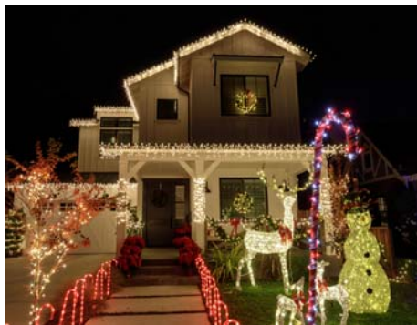
Neighborhood holiday lights

Enjoy a mile long walk of beautiful lights and a festive experience at Pittsburgh Botanic Garden's Dazzling Nights throughout December starting at 5 p.m.