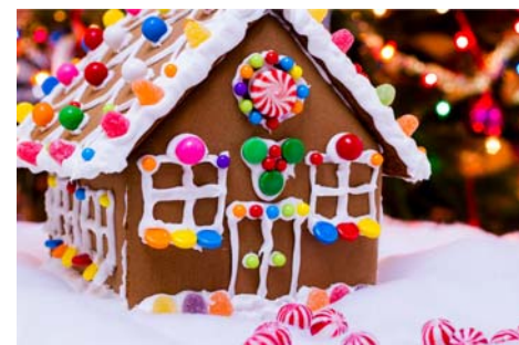
Try building a gingerbread house.

You can celebrate the season without ever leaving home. Try decorating your own gingerbread house. That's an activity for all ages. Bake some delicious cookies. Use the sea-