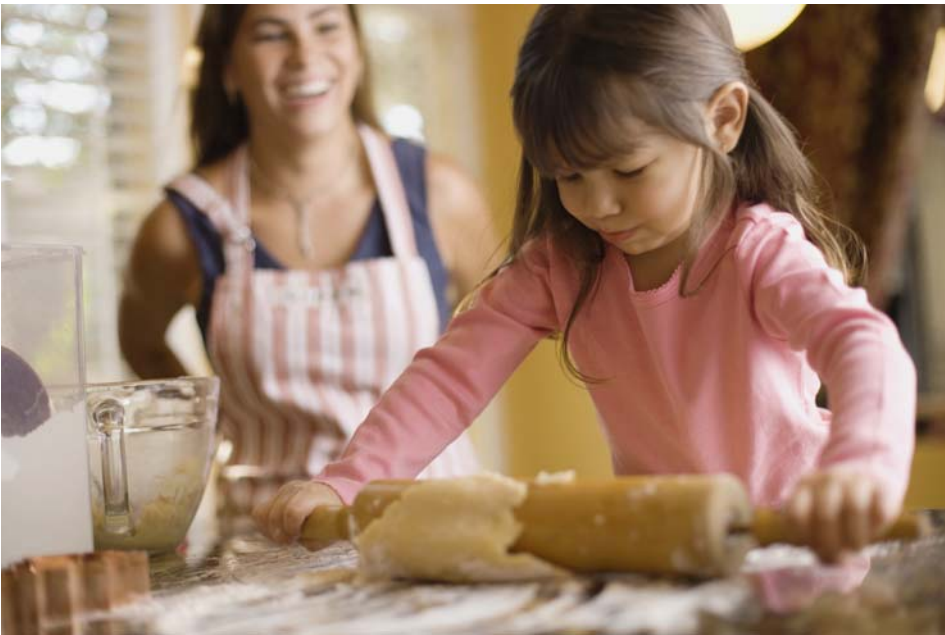
Having fun making holiday cookies!

December seems to arrive the minute you blink after Thanksgiving dinner and will be over just as fast, as well. It will be a whirlwind of sparkling lights, fun activities, cooking, shopping, visiting, some expected chaos, love, laughs and very little sleep. Try to enjoy the little moments throughout the month to slow it down a bit.