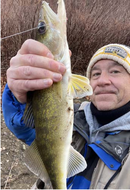
A beautiful walleye from my "different" spot.