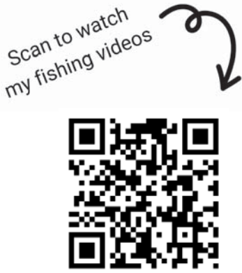
Scan to watch my fishing videos

that you make safety your number one priority when venturing out onto the ice. "First ice" is often very productive, but it is always very dangerous. Use extreme caution and keep those lines tight. Send your pictures and stories to samdhall@comcast.net . Next month I will have some details about ice fishing safety you can keep in your vest. Happy Holidays!