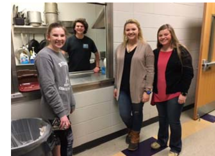
Thanks Junior Civitans from Byrnes High School for your help!