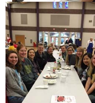
Students from St. Norbert's College (WI) in Spartanburg for week to help Christmas in Action