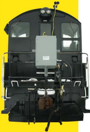
MU Receiver on locomotive