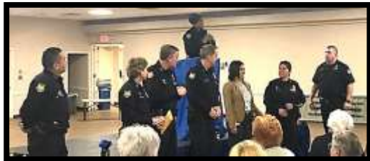
the Assistant Chiefs