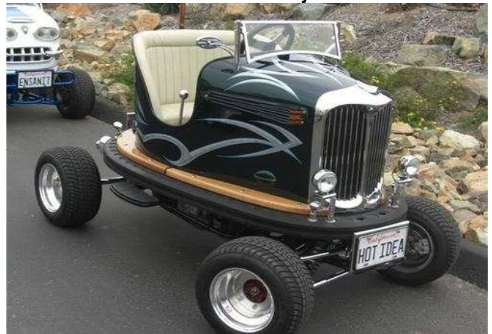
How is this for a bumper car? Notice the tags