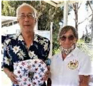
Names were not provided with the photos.