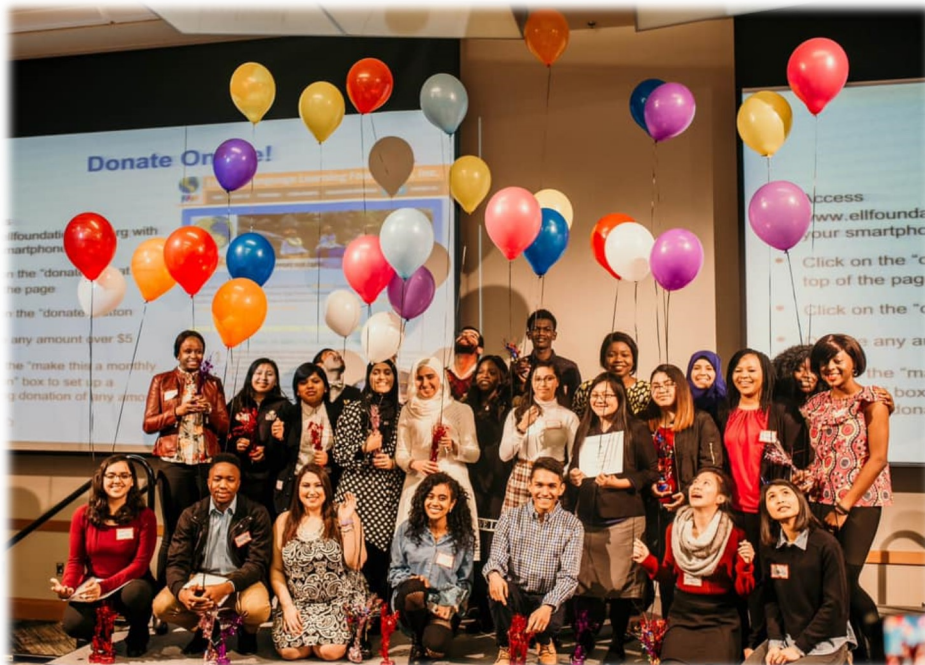
2019 ELL Foundation Recognition Breakfast