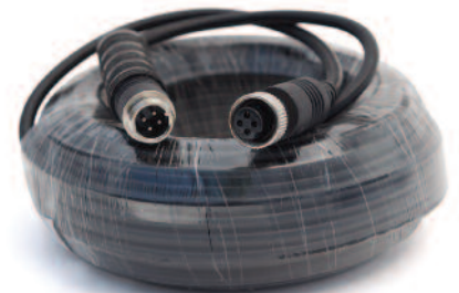
8.0mm Diameter Video Cable (Available)

CALL TODAY FOR A FREE ESTIMATE • 909-413-1409 • www.TopMobileVision.com 2220 Eastridge Ave. Suite O, Riverside Ca 92507