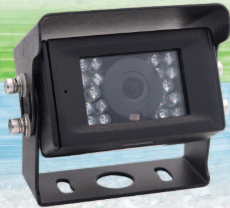
Waterproof Back Camera: TMV-18WPC-LT