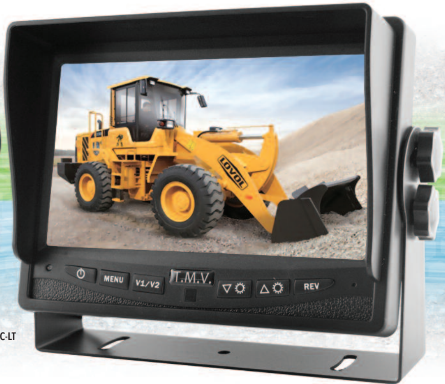
7 inch LCD Monitor Model: TMV-7LCD-LT