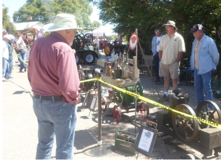
McGuireville May 2019