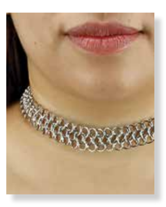
J257 SILVER EVENTS CHOKER | Collar | Unique silver design form this stunning connected choker. 11"L with a 3"L extension & lobster clasp closure. $19.50