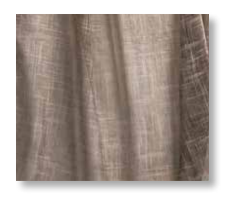
H216 CRISS-CROSS COCOA SCARF | Bufunda | Cocoa colored scarf with thin delicate criss-cross beige lines design. 100% premium viscose. 68"L x 25"W. $19.50

One of the easiest ways to tie a scarf, for this look, find yourself a long scarf like this one. Wrap around your neck twice, leaving one scarf end on each side.