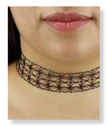
J258 LACEMAKER CHOKER | Collar | Delicate double row lace pattern choker. 11-½"L with a 4-½"L extender and lobster clasp closure. $19.50