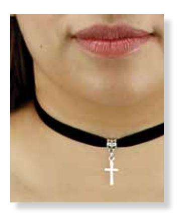
J259 FAITH CHOKER

|Collar| Single silver cross accents this soft black velvet choker. 12"L with a 2"L extender and lobster clasp closure. $19.50