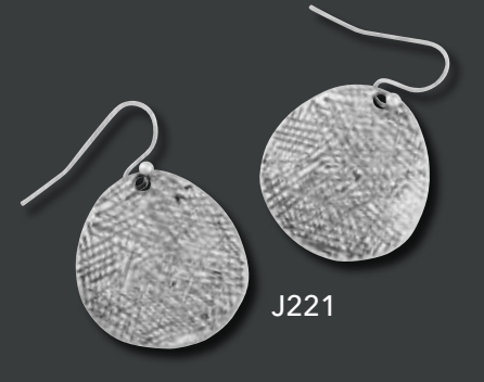
J221 SCALLOPED EARRINGS |Pendientes| Silver scalloped textured discs on fish hook back. 1-1/4"L. $15.00