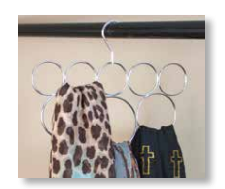
H753 IN CIRCLE SCARF HANGER |Percha para bufanda | Organize and hold multiple scarves. 10"W x 13"H. $15.00