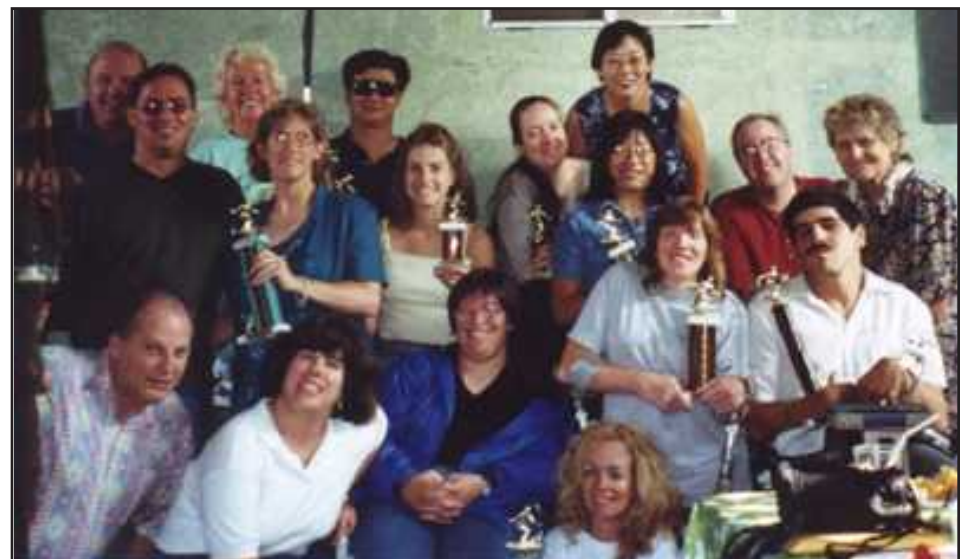
The Unrecables' Annual Party in Alhambra in October 2000.