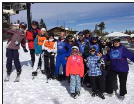
January 2016 trip.