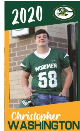
Option 3 ½ - length photo

To order, please click here to be directed to our sister-company website, PsychMXGrafix.com. If you have a photograph in mind that you would like to use, please choose the design that best fits your photo style. If you have not yet taken your photo, please follow the recommendations below to achieve the best possible result.