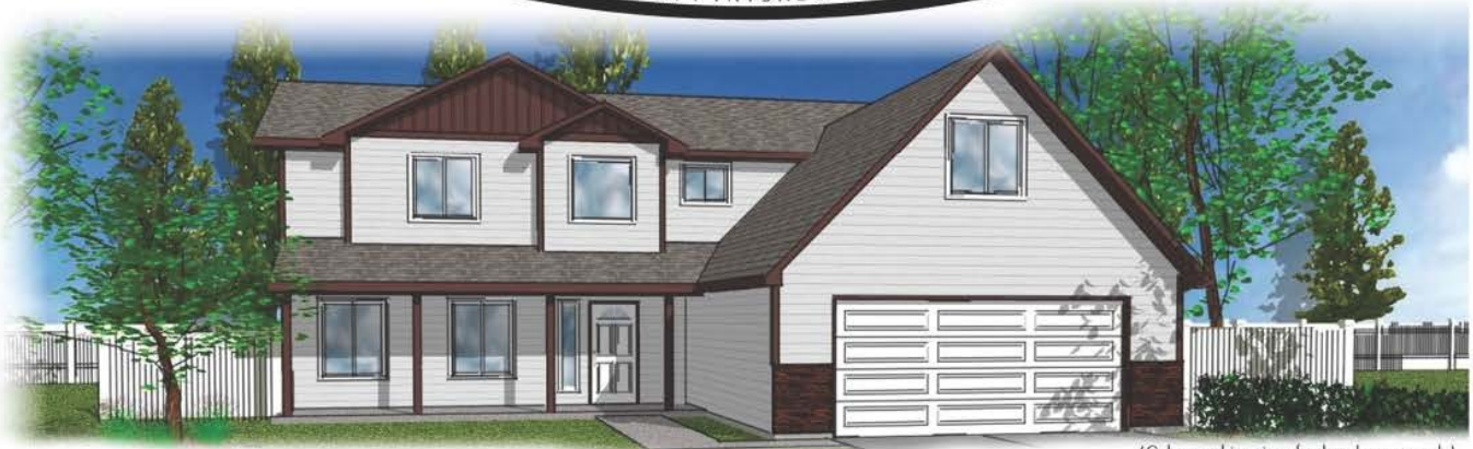
(Color combinations for brochure use only)

All measurements, dimensions and square footage are approximate and may vary. Prices may change without notice.