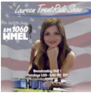
Targets of Terror !