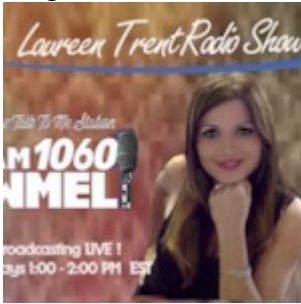
special Guest Roger Gangitano Post live Broadcast