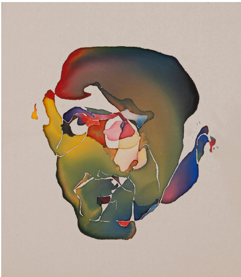
BLIND SELF PORTRAIT, 2015, ink on canvas, 25 x 22 in.